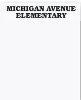
(ex. of proof w/ stock cover)

We discourage the use of fax proofs due to decreased readability.