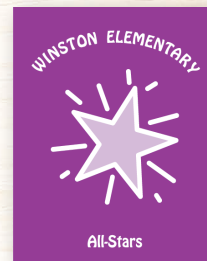
This is a Reverse Cover

#5 CUSTOM FRONT COVER DESIGN – Fill in this line only if you DID NOT select Stock Full-Color RITEShape™ Folders, Stock Ritefolder®, or Stock Full-Color Rules Handler in Line #4. Suggested styles of front covers are shown on page 29 of this catalog. Check the first box and insert the letter corresponding to the style you desire. If you choose a mascot from Progress Publications® website, insert the name and number corresponding to the mascot you desire. Check the second box if your custom front cover does not match any of the styles on page 29. Remember to include a mock-up of your design with your order.